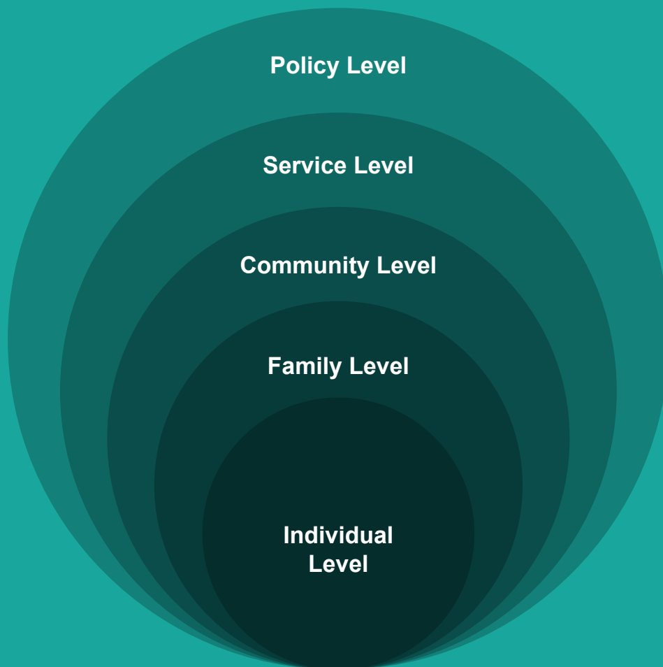
Figure 3: Social Ecological Model for Preventing Violence Against Older Women

This section outlines a Social Ecological Model for Preventing Violence Against Older Women. A critical lens is taken to consider power, promote reflection and guide informed action. 150, 151 As Figure 1 below shows, five levels of focus for preventing DFSV and improving responses for older women are presented. These levels are then explored in the following section.